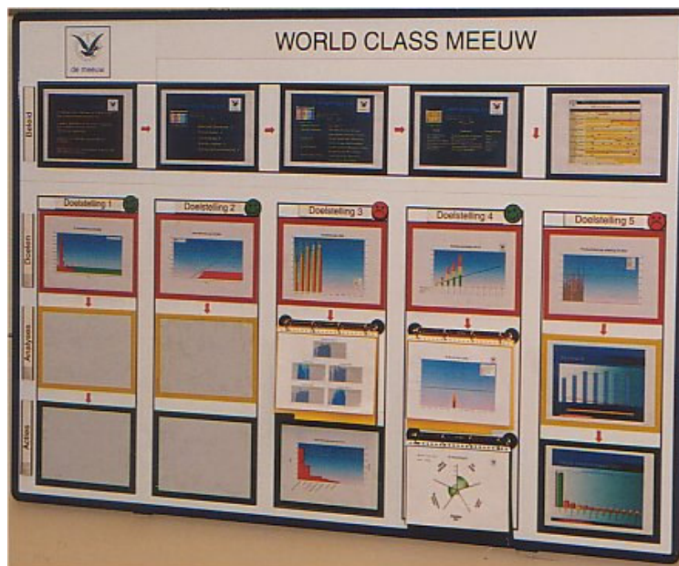
Policy Deployment: from vision to reality